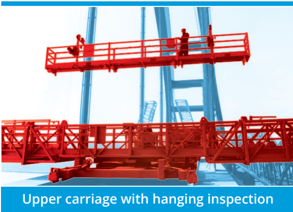
Upper carriage with hanging inspection