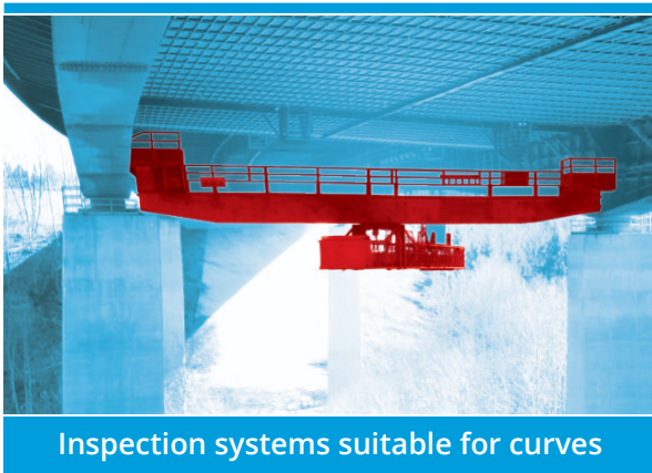
Inspection systems suitable for curves