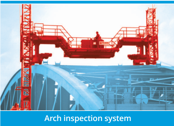
Arch inspection system